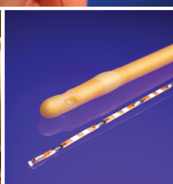
MOSFET dosimeters are small, light-weight, unobtrusive, and versatile. Pictures above show the small size of the microMOSFET, a high-sensitivity MOSFET being used to measure scatter dose to the thyroid, and the Linear sive Array for use in brachytherapy.