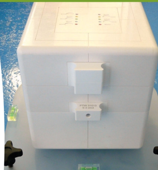
MOSFET Calibration Phantom Prototype